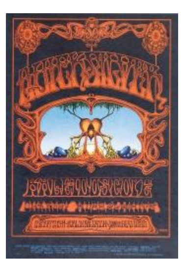
The Eternal Reservoir

1968-01-12 FD-101 Eternal Reservoir, bleeding heart (important in this context)