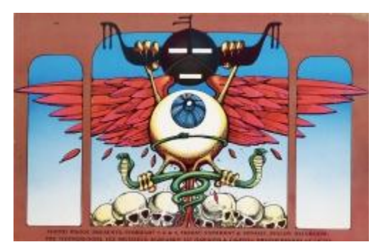
The Winged Eyeball

1969-02-07 Winged Eyeball, Soundproof (important in this context)