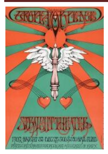
Grope for Peace